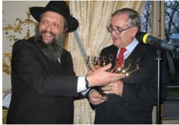
France - Prime Minister Jean Pierre Raffarin

• It is against Israeli law for Christians to